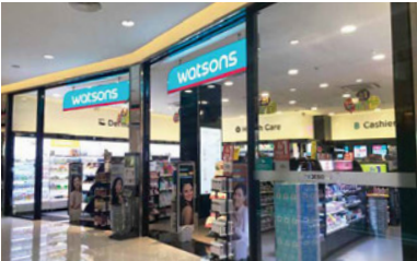
Watsons Thailand – 7 new stores