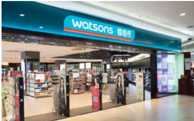
Watsons China - Over 120 news stores