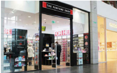
The Perfume Shop – Aberdeen