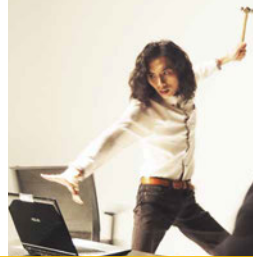
Watch the viral video! ▶