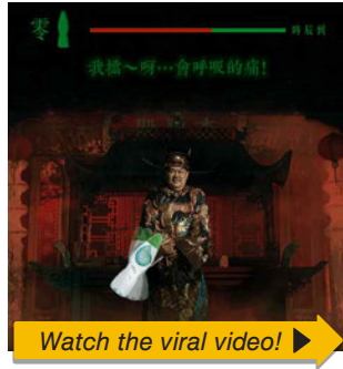
Watch the viral video! ▶