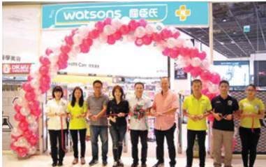
Watsons Taiwan - 8 new stores