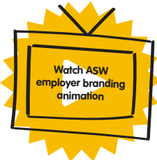
Brand communications activities across Asia and Europe to mark the global launch of our employer brand