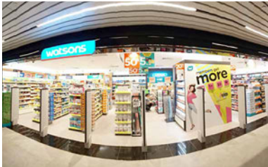
Watsons Singapore - Singapore Post Centre