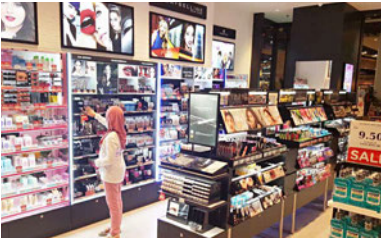
Watsons Malaysia - 12 new stores