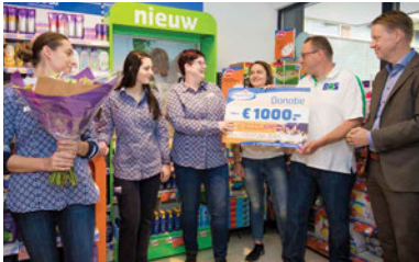
Trekpleister – Tiburg