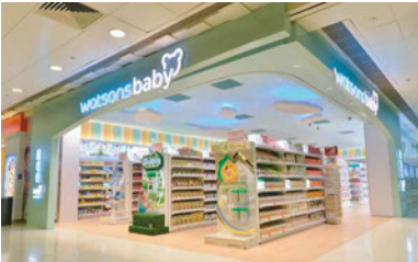
Watsons Hong Kong - Watsons Baby store at Tseung Kwan O