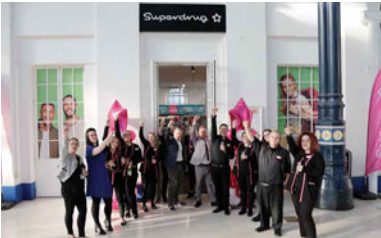
Superdrug – Brighton Railway Station