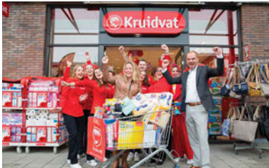
Kruidvat – 10 new stores