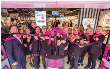
ICI PARIS XL – New concept store