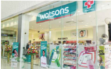
Watsons Philippines - 23 new stores